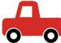
PICK UP TRUCK