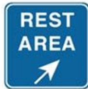
REST AREA SIGN