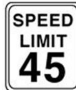
SPEED LIMIT SIGN