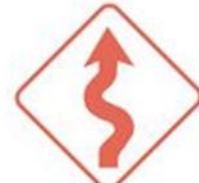
CURVY ROAD SIGN