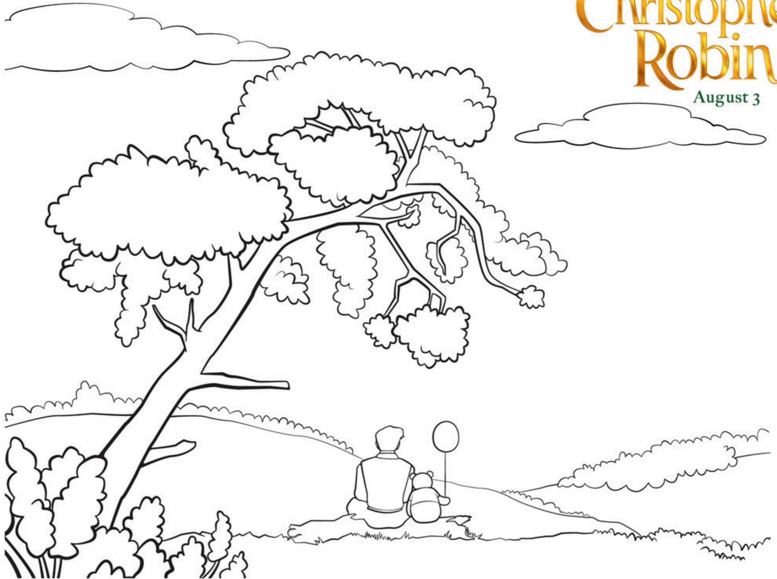
Christopher Robin and Pooh enjoy another sunset together.