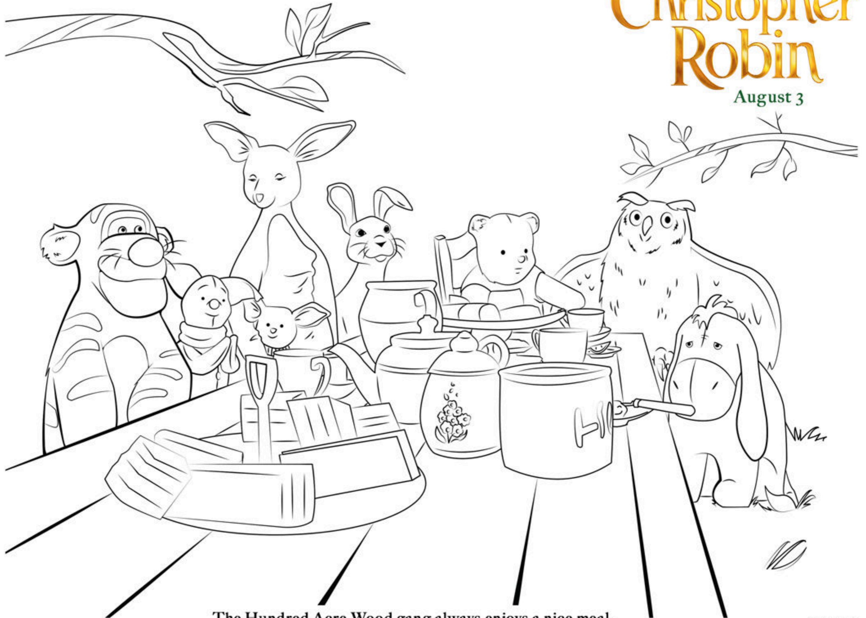
The Hundred Acre Wood gang always enjoys a nice meal.